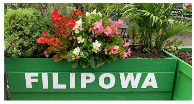
A planter box in the club's picnic area at the festival