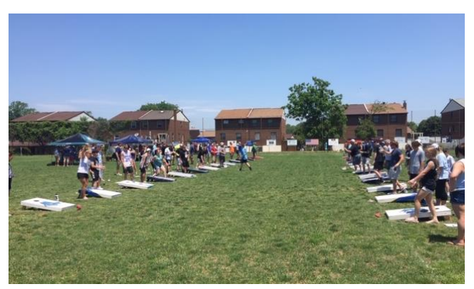
A great turnout at the cornhole tournament

During the summer the soccer program held a cornhole tournament along with a beer tower raffle. The soccer field was turned into a tournament setting with 36 competing teams. It was a huge success for the program.