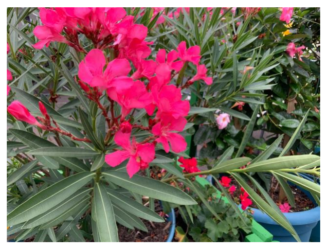
Beautiful flowers in the club's picnic area