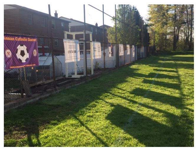
Banners hang by the soccer field

It's only taken 50 years, but the soccer program has finally decided to allow a professional to tackle the soccer field's grass condition – a lot of weeds. To date there have been 5 fertilizer applications with a final fall seeding to take place. No more excuses about field conditions will be accepted starting next spring for missed traps or missed goals. The cost of the treatments is being funded by the sale of advertising banners (3' x 5') along the soccer fence. To date twelve companies have purchased banners. If interested in supporting the field improvements, contact a soccer coach or board member.