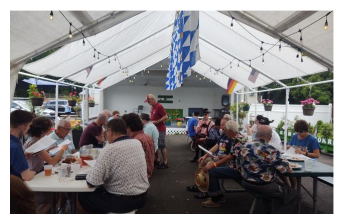
A great day to be under the tent

The club hosted its annual picnic and pig roast on Sunday, July 11. While it was a slightly lower turnout than usual, it was really nice to see so many familiar faces at the club again. Thank you to all the members and friends who attended and to all the volunteers who helped to make the event a success.