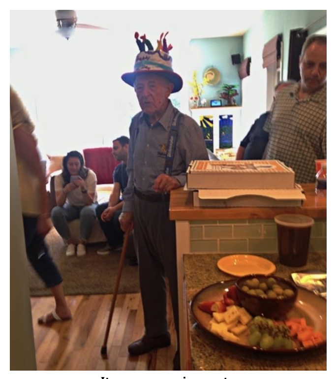
It was a surprise party