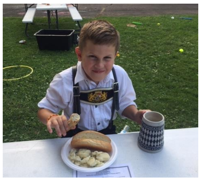
Enjoying a good German meal