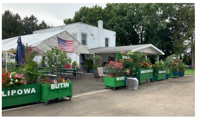
A view of the flower boxes in the club's picnic area