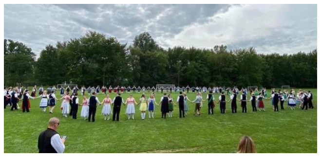
The Jugend participate in the friendship dance