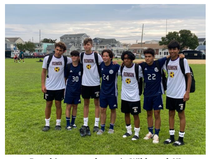
Danubia soccer players in Wildwood, NJ

The #7 ranked Danubia Gunners won the 2021 Hershey Cup in August to kick off the fall season.