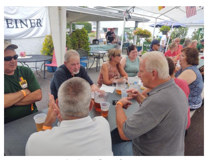
Enjoying a fine afternoon