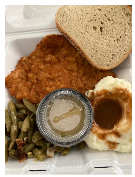
A generous portion was provided