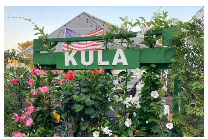
A close-up view of the Kula sign with flowers