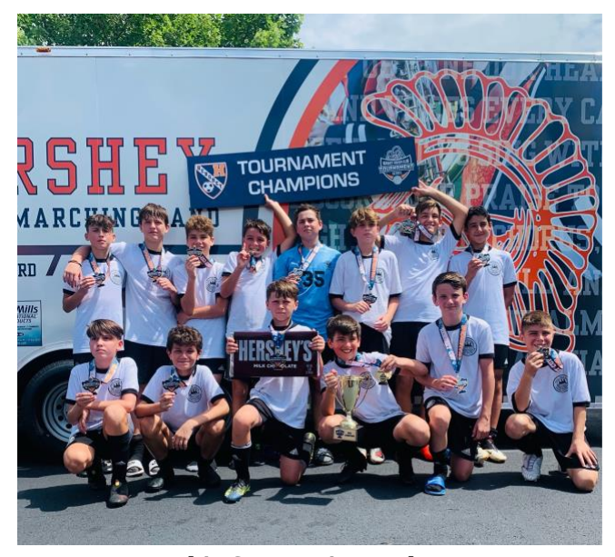
Danubia Gunners in Hershey, PA

The #7 ranked Danubia Gunners won the 2021 Hershey Cup in August to kick off the fall season.