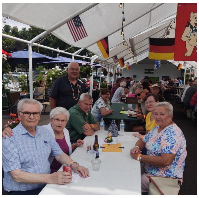
Guests enjoying themselves at the annual club picnic