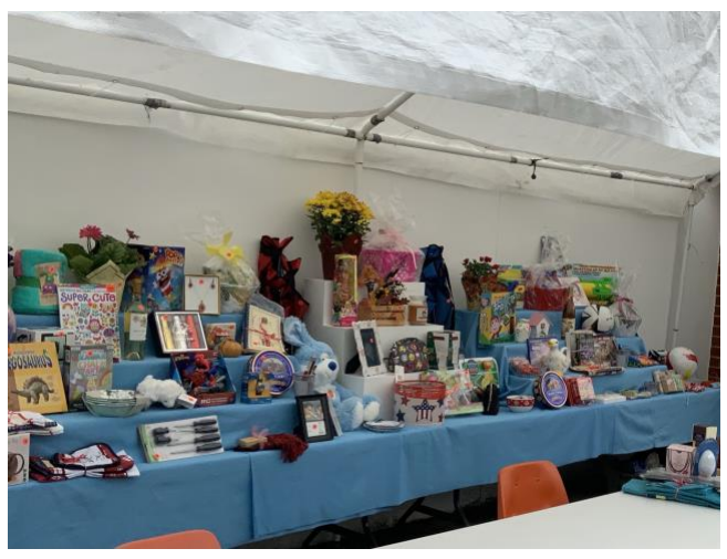
Ladies Auxiliary Verlosung table