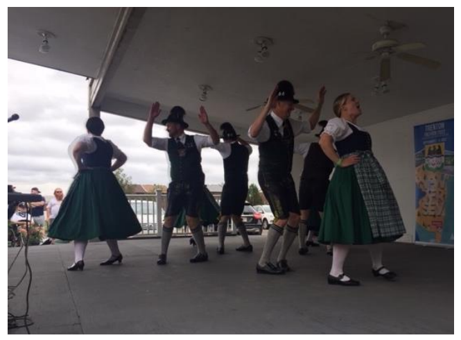
G.T.V. Almrausch dancers