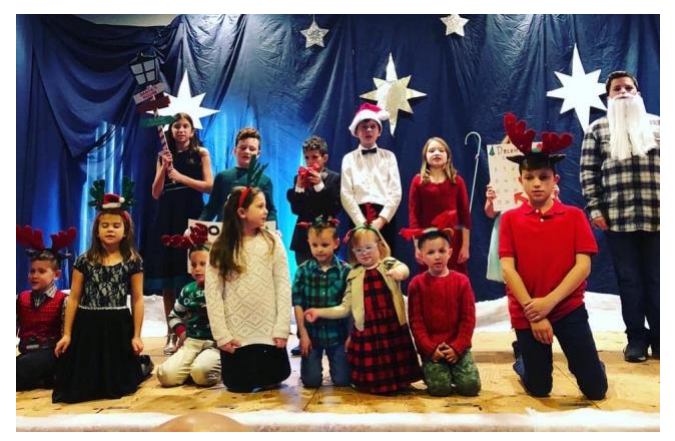
Another great Christmas show!

Then it was time for the show. With a total of 18 children, ranging in age from 2 to 12, there was a wonderful and lively program. They started their performance with a rousing rendition of the current hit "Baby Shark" but updated the words to singing Santa Shark as they danced their way up the aisle. There were a few more songs, a variety of poems, a violin solo, two ensemble songs, and finally, the Nativity scene. This year, the Nativity was a bit less traditional, told from the perspective of the many animals that visited Baby Jesus. Each of the children showed off their talents, and the parents, and especially grandparents, clapped with real enthusiasm. It was a wonderful start to the season.