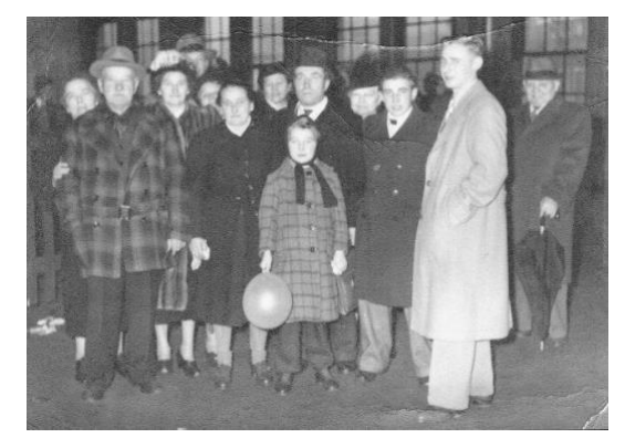
Relatives that I never know I had greeting us in New York Harbor