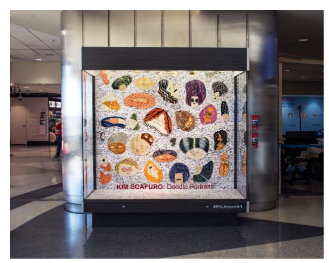
Artwork by Kimmy Scafuro

See more of her work at https://www.phl.org/atphl/art-exhibitions/kim-scafuro.