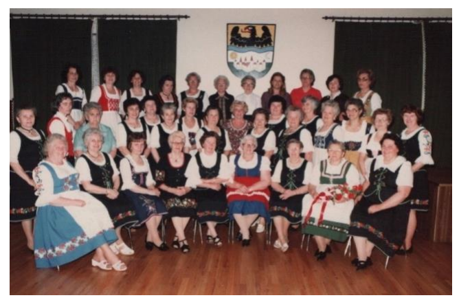
The Frauengruppe, likely in the 1980s

The following photos were shared by Roswitha Hoenisch. The first is of "The Frauengruppe" probably around the 1980s. The other pictures are of a "fashion show" of our home sewn dresses, possibly from 1973.