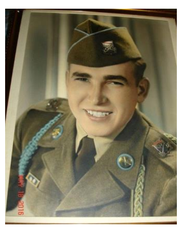
A proud American citizen