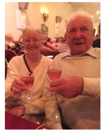
Prost to 70 years in America!

Note: This article was published with minor grammatical and formatting corrections to the original.