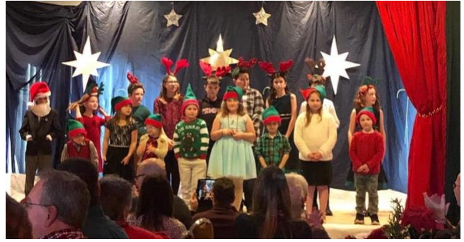
Guests enjoy the performance