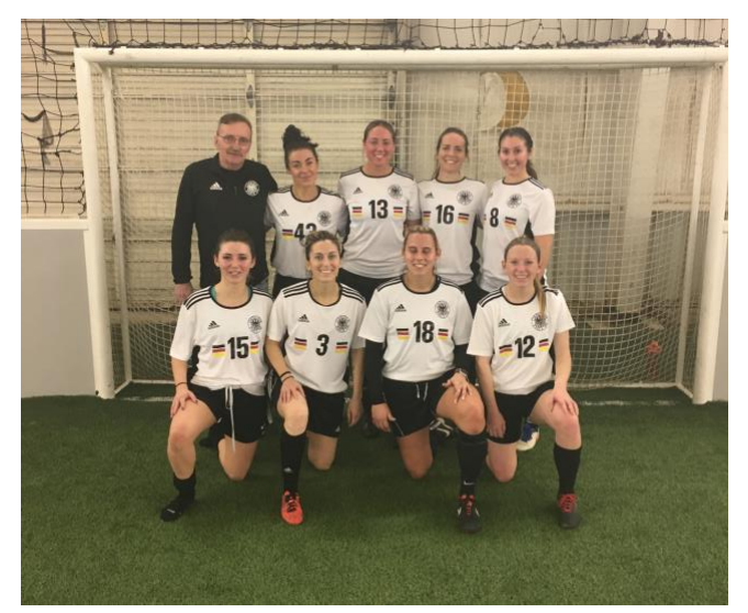
Danubia Women - "A" Division State Champions

We are also so proud of the Danubia women! They were back-to-back "A" division state champions!