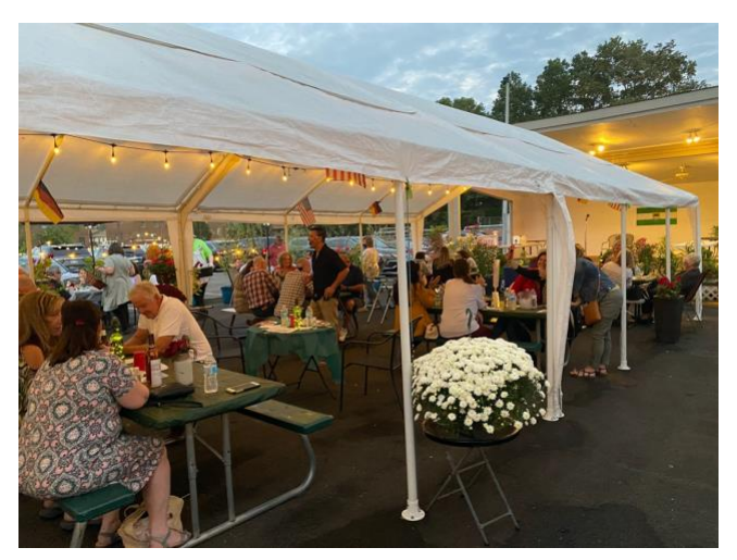
Guests enjoy the 2020 outdoor Wine Tasting event