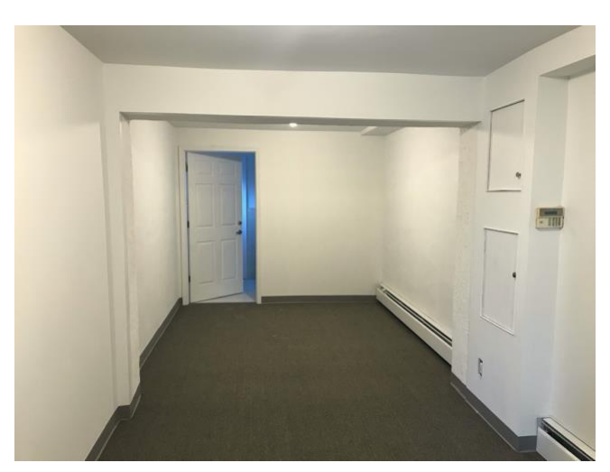
The entryway upon being finished last year

We are examining all the items donated to us in the past, and we will be selecting items for our display area. If anyone wishes to loan the club appropriate items for display, please contact us.