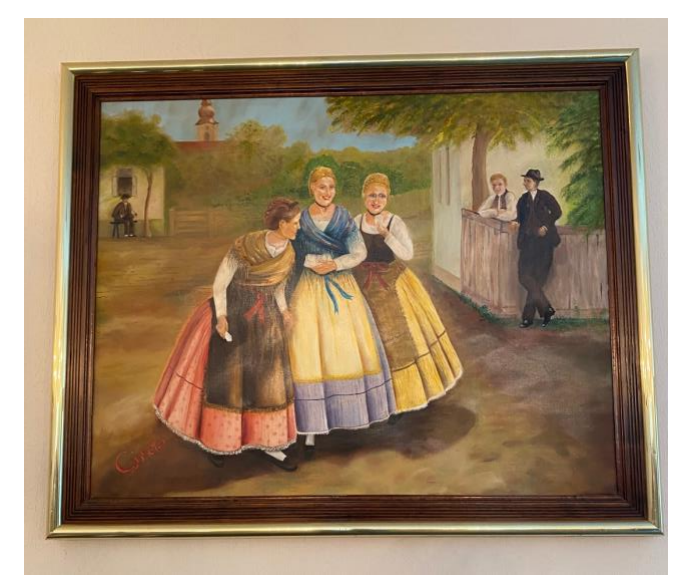
Painting hanging in the upstairs hall at the club

The next time that you visit the Donauschwaben club, take a moment to look at the large painting hanging in the upstairs hall. The painting shows three young ladies all dressed in their Trachts that seem to be checking out the young men standing nearby (see photo). I guess this is how meeting that special someone took place in the old country.