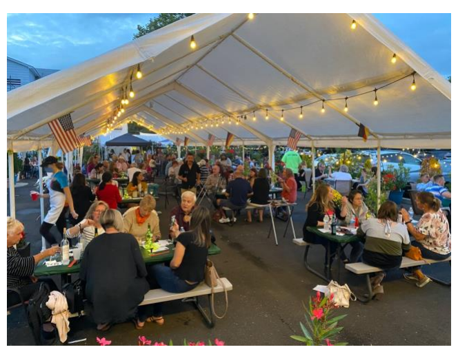
A beautiful evening in the picnic area