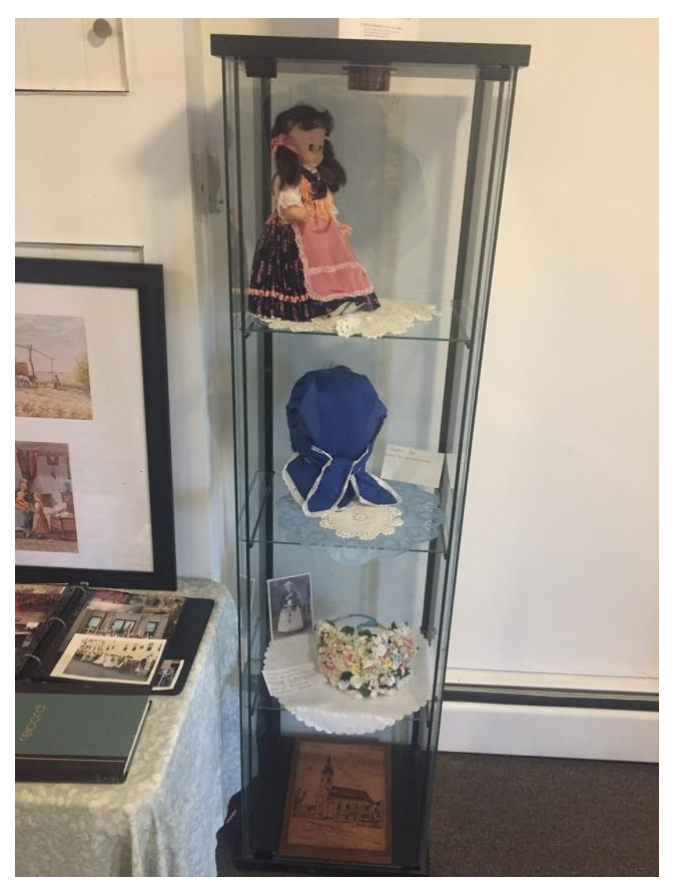
One of the display cases in the newly expanded foyer