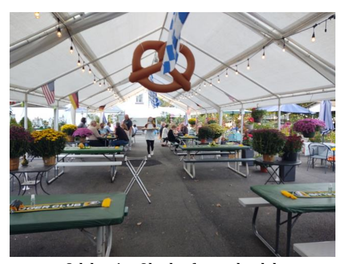
Celebrating Oktoberfest at the club

Many thanks to all who worked tirelessly to ensure that these outdoor dinners could take place safely and still with our usual quality!