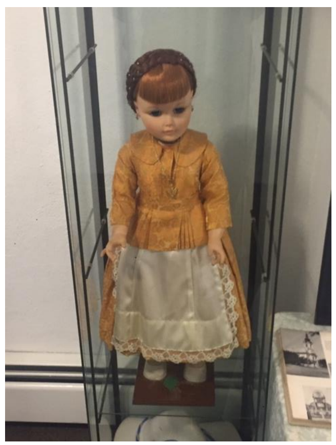
A doll in Tracht