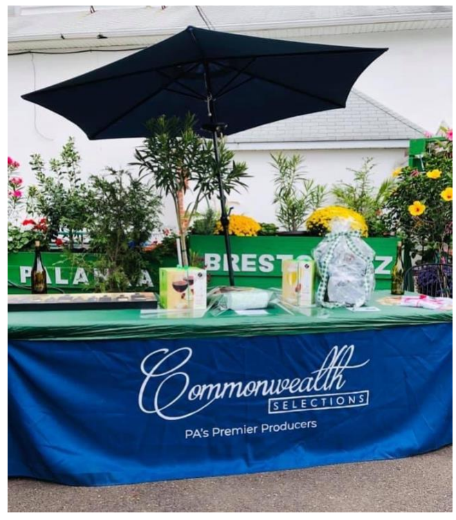
Ready for the Wine Tasting event to begin