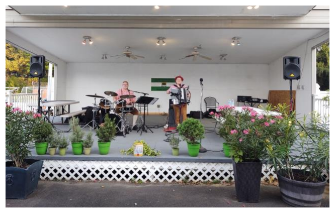
Live music at the club's Oktoberfest dinner