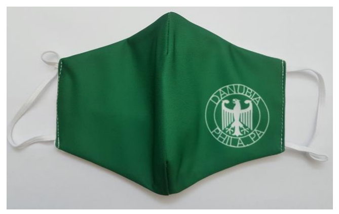
Danubia solid mask

Visit our web site for the latest news and events! www.danubeswabian.com