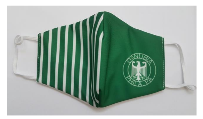
Danubia striped mask

You can't just wear a plain mask these days; you have to be fashionable and make a statement with your mask. Well, our youth soccer teams wishing to be uniformly dressed had masks manufactured with the club's soccer logo. They are also available to members and friends. Cost is $12. Proceeds go to the soccer program. Please support the teams. You can purchase a club mask by contacting a board member or one of the soccer teams. When ordering, please indicate if you want a solid or striped mask. Thank you for your support!