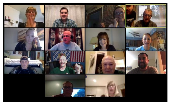
A virtual board meeting in May via Zoom

Once again, we are grateful for your continued support and look forward to seeing you at the club again soon!