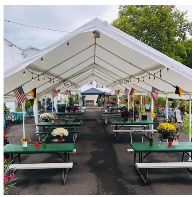
The outdoor picnic area in preparation for the Wine Tasting event