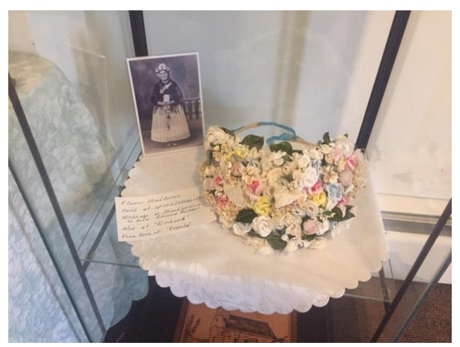
Note the fine detail on the head ware