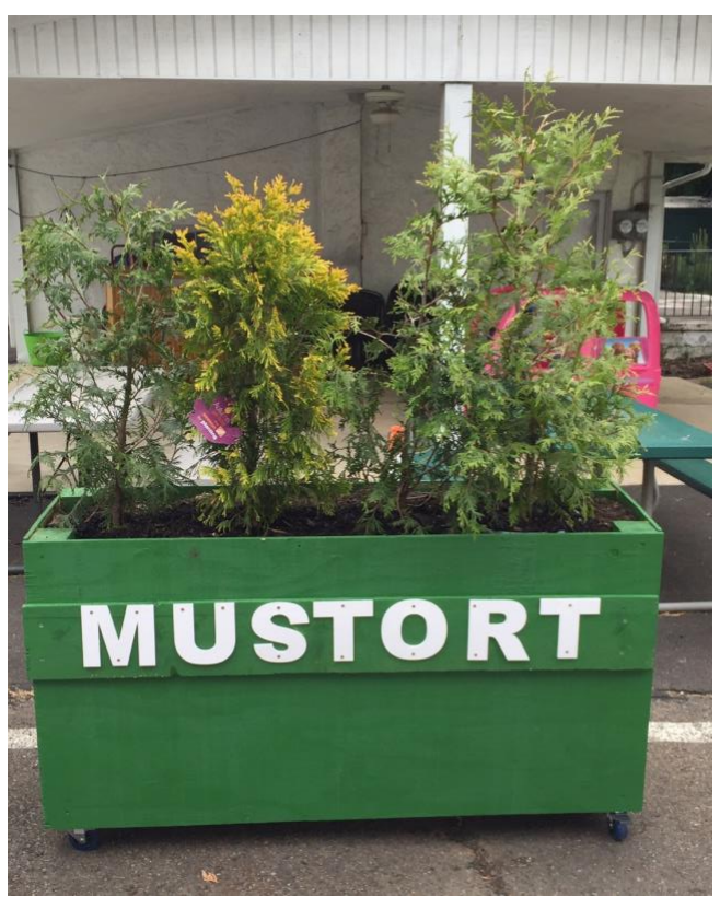
Special recognition goes out to Fred Gauss and all of the other club volunteers who have helped to make the outdoor picnic area so beautiful!