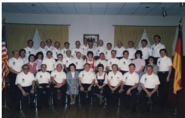
Board of Directors - May 12, 1986