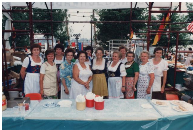
300-year celebration at Penn's Landing (1983)