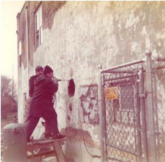
Drilling the hole for the kitchen fan