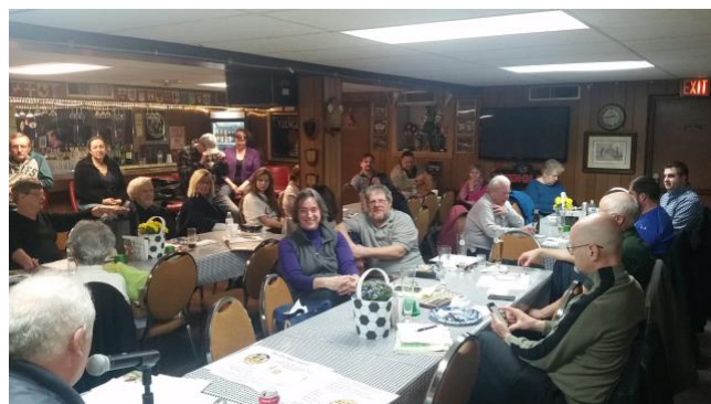
2019 General Membership Meeting