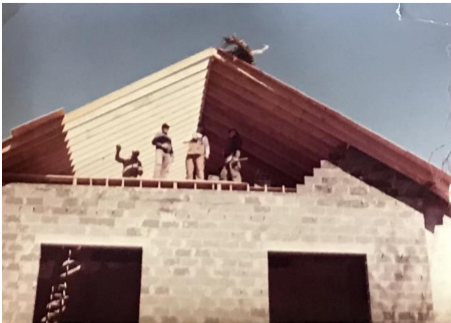
Working on the roof - be careful!