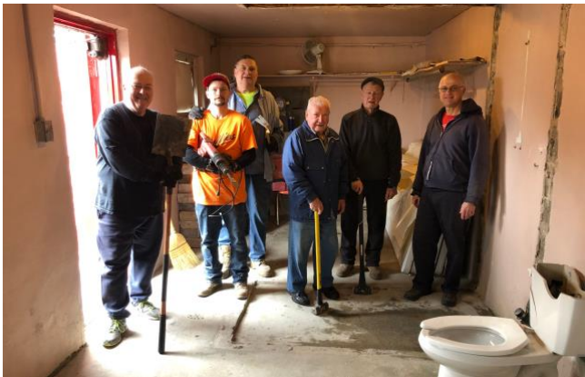
Volunteers knock down the temporary walls to clear the way for the new work