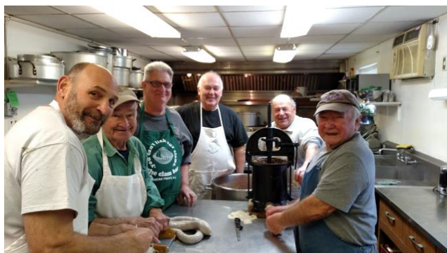
Preparing the bratwurst and liverwurst for the Schlachtfest