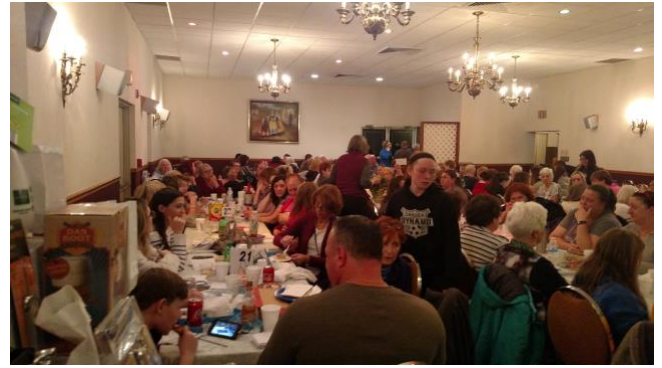
Guests enjoy this year’s Penny Party