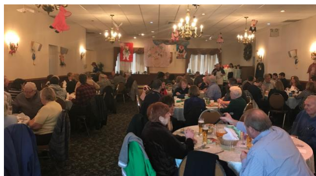
A nice crowd for the traditional Schlachtfest