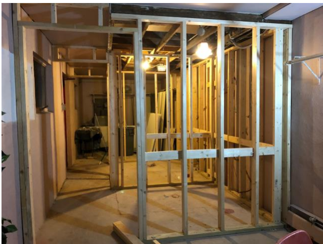
The walls are now up, thanks to the carpenters!