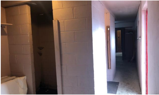
The locker room area was cleaned out before demolition started