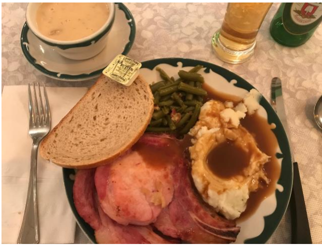
A delicious Kassler Ripchen dinner!

With the start of Lent, the Friday night dinners included a several fish dinners and another Suppe und Palatschinken dinner.