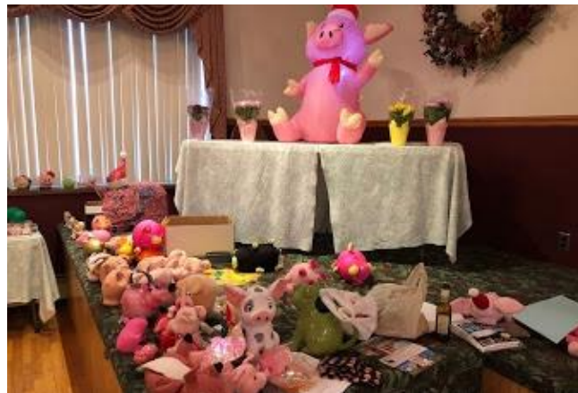
Plenty of nice decorations at the Schlachtfest