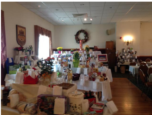
The hall is ready for the Penny Party