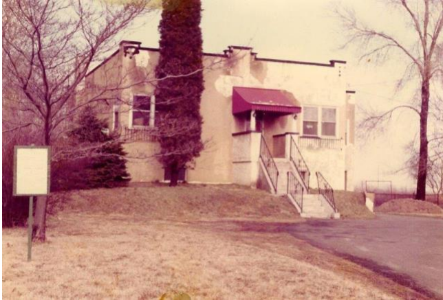
This is how the building looked when it was purchased