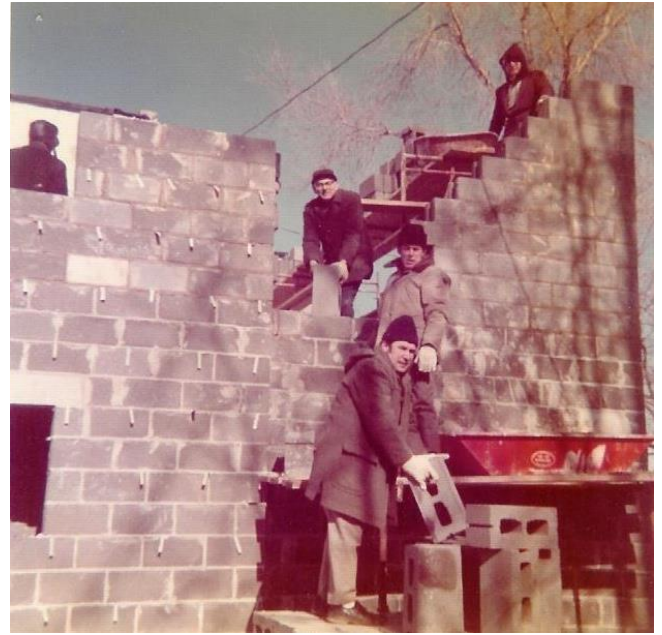
Handing up the cinder blocks