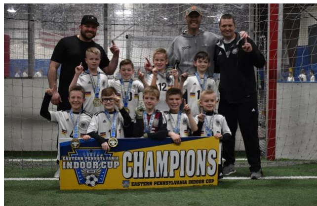
Danubia Soccer Club EPYSA Indoor State Cup Champions