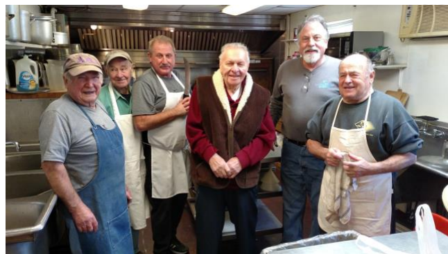
Volunteers helping to prepare the meats for the Schlachtfest