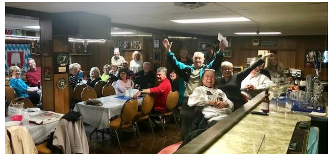
The Wednesday night shuffleboard crew having a nice time at the club

Did you know that our club has a shuffleboard league? Many of our club members come out in the evenings and have a great time.