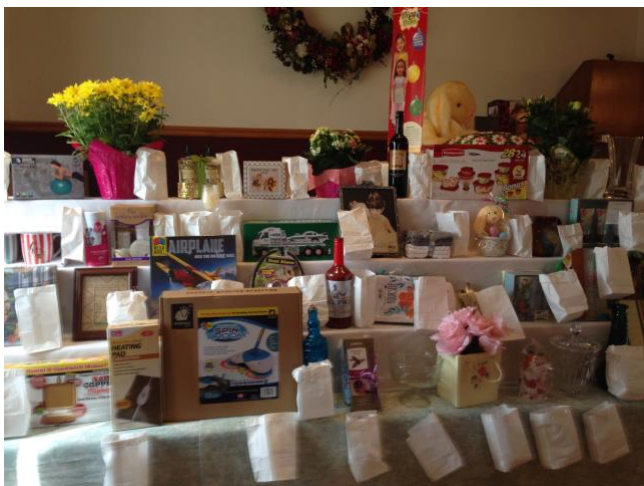
So many great prizes!