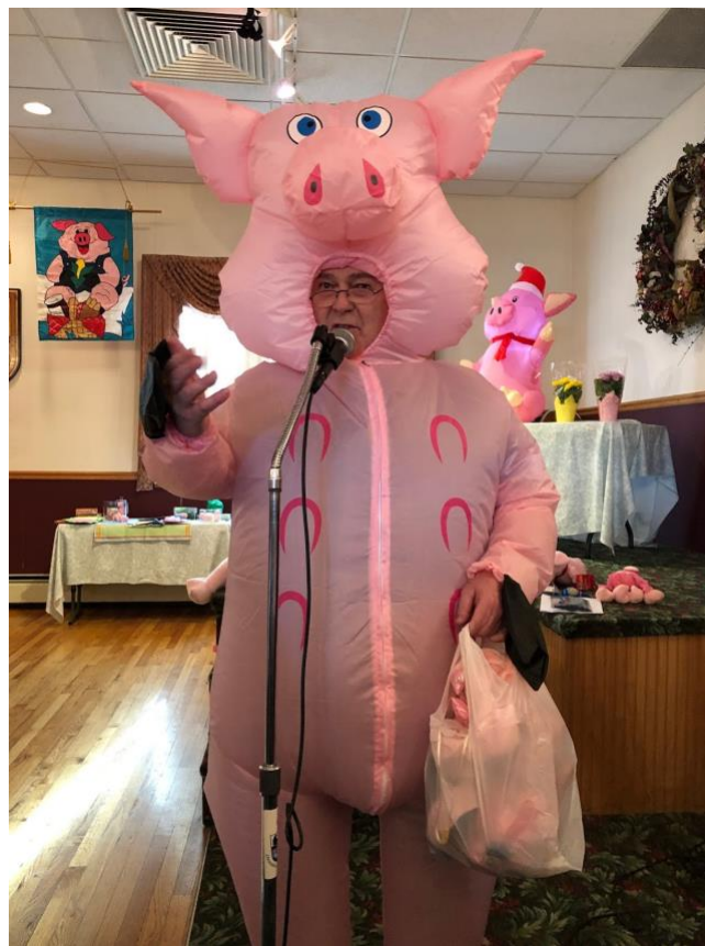
A special guest at the Schlachtfest this year