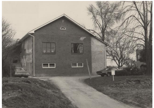
The finished building!