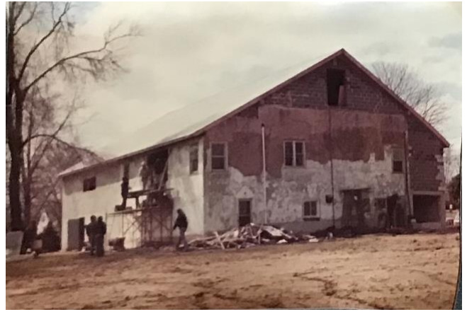
The building takes shape (today, the kitchen area is in the corner in the front-center of this photo)