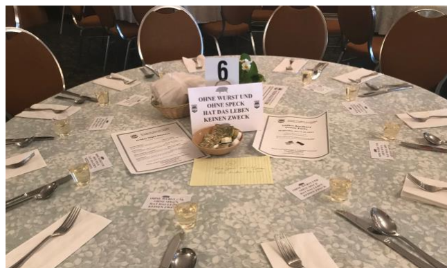
The tables are ready for the meal