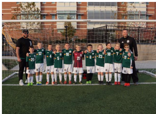
Bethesda Premier Cup Champions

The Griffin's 10' won the Bethesda Premier Cup beating Bethesda Pre-Academy 3-2 in OT, and we also won the Indoor State Cups beating FC Europa 3-1. We played in the semis for outdoor state cups on May 4, where we were matched up against FC Europa again.