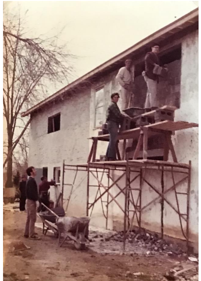
Continuing work on the club