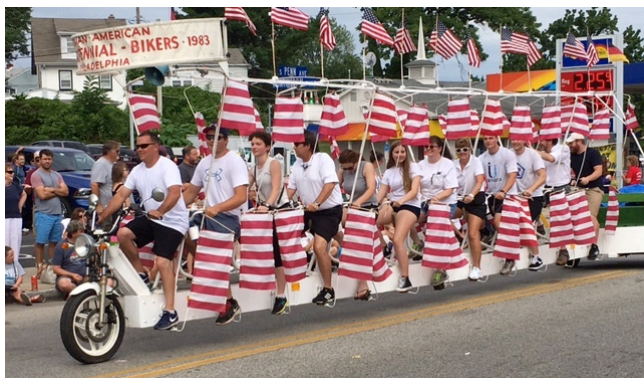
Club members ride the 12-person bike in the Rockledge 4th of July parade