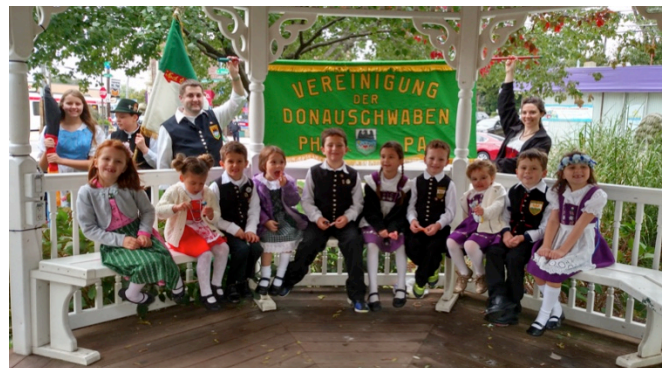
2015 German-American Steuben Parade