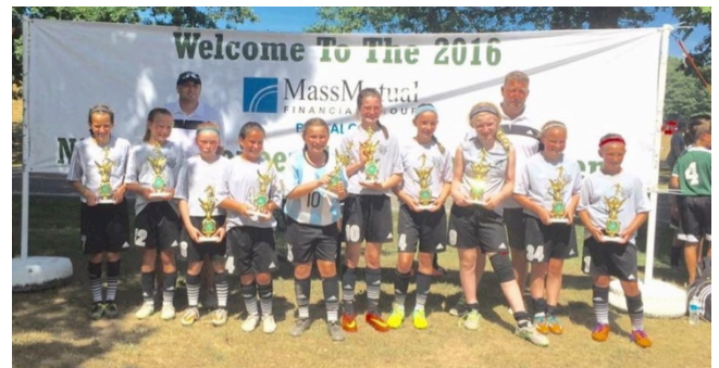
Danubia U-11 girls win the championship at the Niagara Pioneer Soccer Tournament

Our Danubia Dynamo U-11 Girls team went up to Niagara Falls for a weekend in July and won the championship at the Niagara Pioneer Soccer Tournament! The girls went undefeated in bracket play, playing teams from Ohio and New York. They won the championship game 4-1 against the host team, Niagara Pioneer. Congratulations!