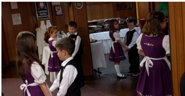
The Kindergruppe performs during the annual Mother's Day Luncheon