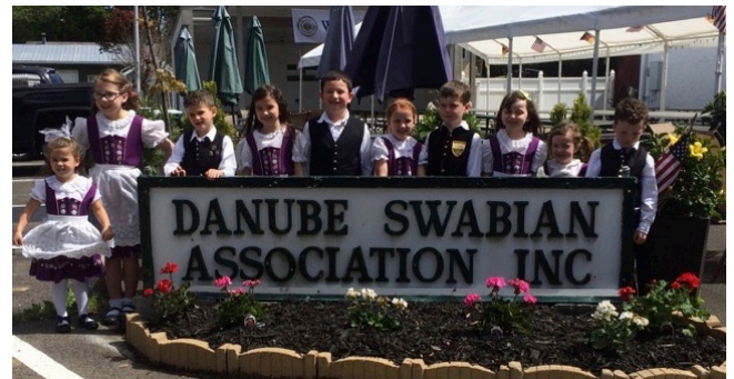
Our Donauschwaben Kindergruppe