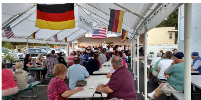
Club members and friends enjoy the sounds of the Cardinal Dougherty Alumni Band