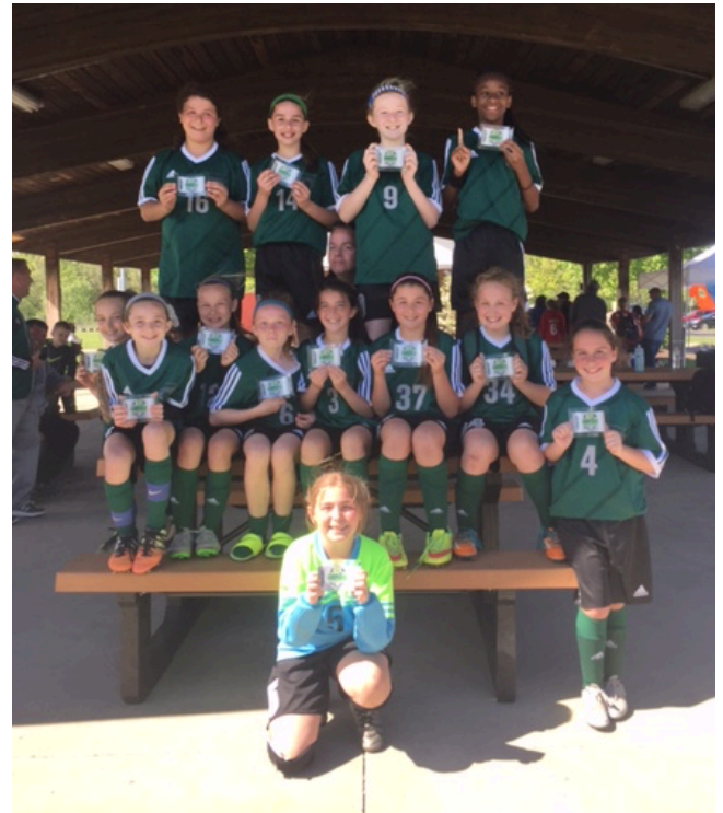
Danubia U-11 girls achieve a 2 nd place finish at the Mother's Day Epic tournament

Our U-11 girls participated in the Mother's Day Epic tournament in Yardley, PA. As they would proudly say, they "dabbed" their way through this one coming in 2nd place!!