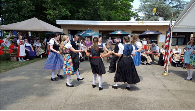
Members of the club's Jugendgruppe dance at German Day

Members of the club's Jugendgruppe danced at German Day hosted this year by the United German Hungarians on Saturday, June 25. Musical entertainment was provided by the Heimatklänge Orchestra. A great time was had by all!