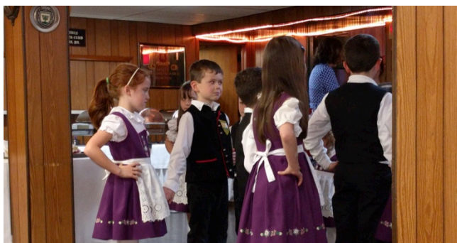
Preparing to dance at the Mother's Day Luncheon