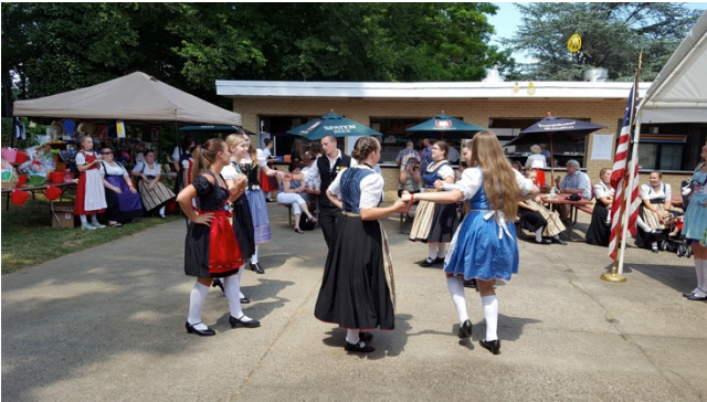
Dancing at German Day