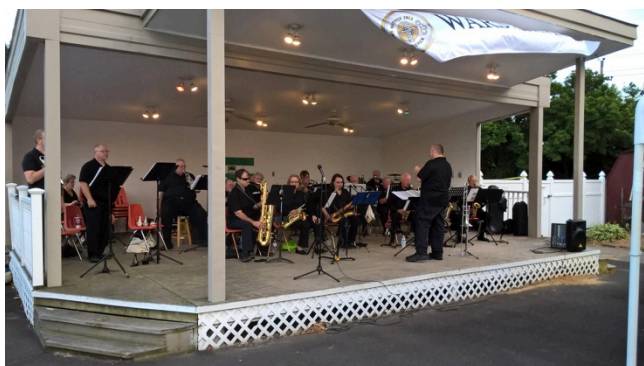
SoundWave Big Band provides music for the club's Summer Concert Series